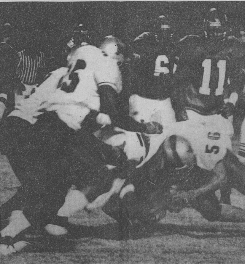
It's plays like this goal line stand in the first quarter of last Friday's game in Hitchcock that has the Rice defense second in the area for yards allowed per game at 128.2. Their average is not quite 12 yards more than the area 4A leader, West Orange Stark (116.3), and almost five yards better than the 5A leader, Willowridge (133.0).